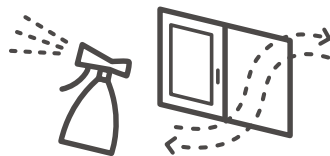
Facility disinfection and ventilation