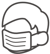
Proper mask wearing