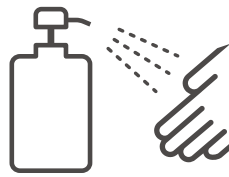
Hand sanitizer availability